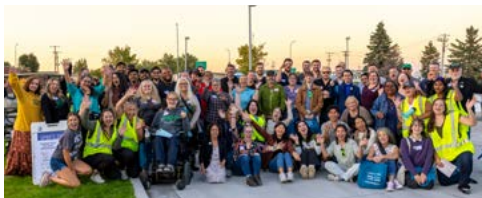
Volunteering with local non-profits