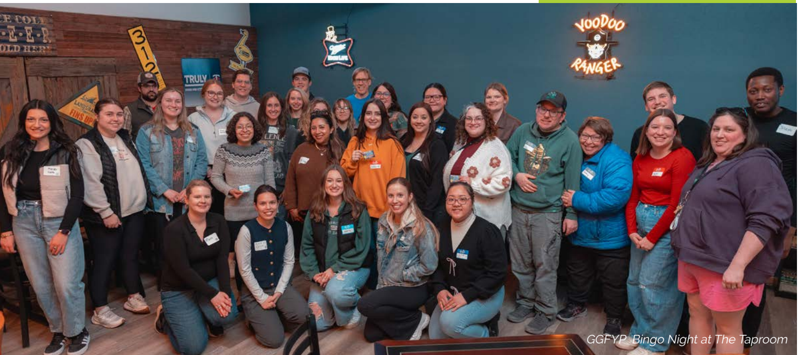
GGFYP Bingo Night at The Taproom

"I joined GGFYP right out of high school and started attending events. By attending professional development events and networking with other members and professionals in the community, I was able to change my career from plumbing to banking. GGFYP changed my life. I'm grateful for the opportunities I've had due to my involvement."