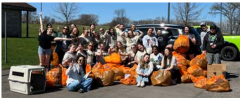
Orange Bag Volunteering