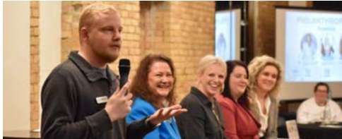
Lunch & Learn Series