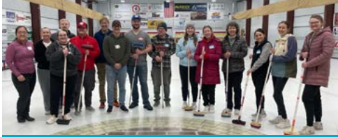
Learn to Curl & Cook-off